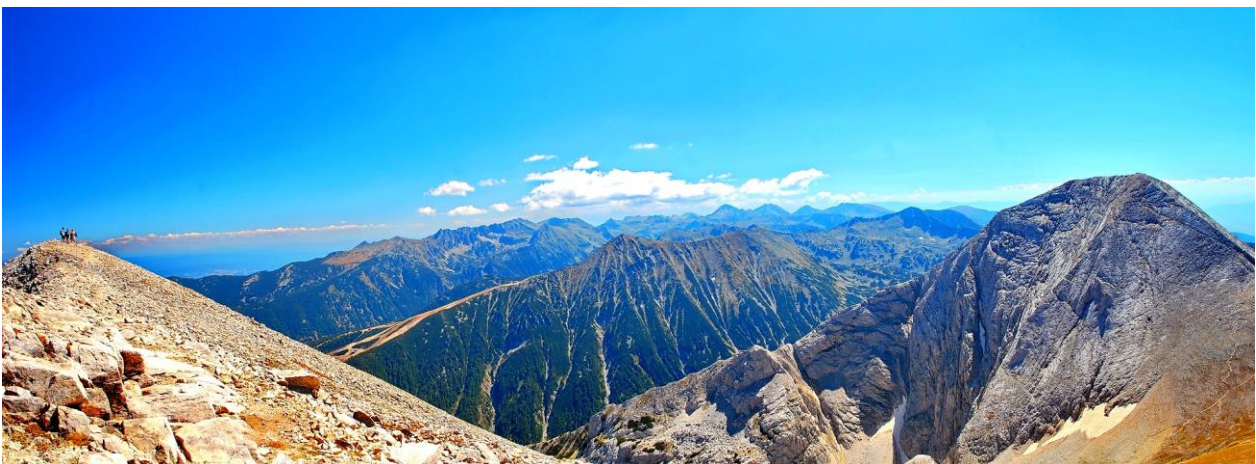
Panorama of the Pirin Mountain range

Tour difficulty: Steady grade, suitable for people with some mountain experience and good fitness.