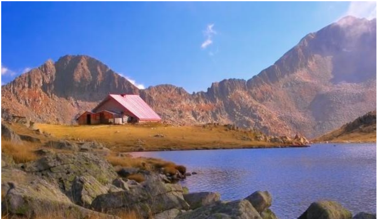
Dark Lake Hut – Pirin National Park (see day 6)

This information should answer some of your questions about the trip and give you a better idea of what we do day to day. It doesn't hope to answer everything however, if you have any questions, please get in touch.